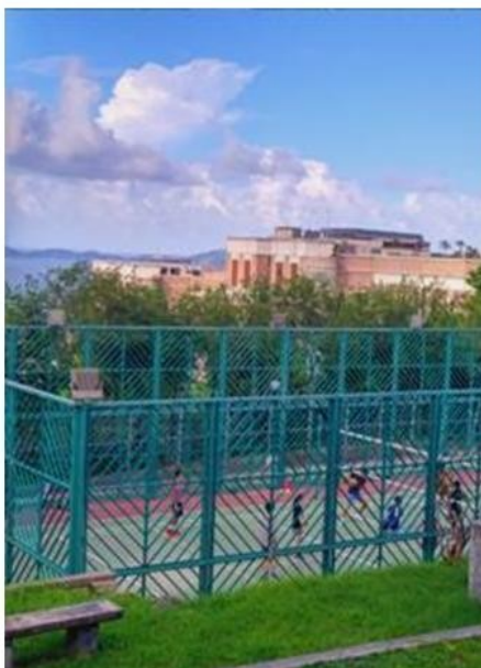
Clear Water Bay and a volleyball game