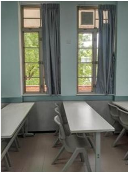
Window seats in classroom 203