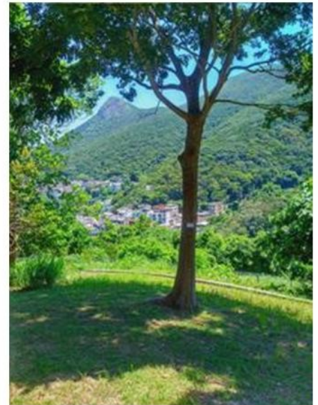
High Junk Peak and a nearby village