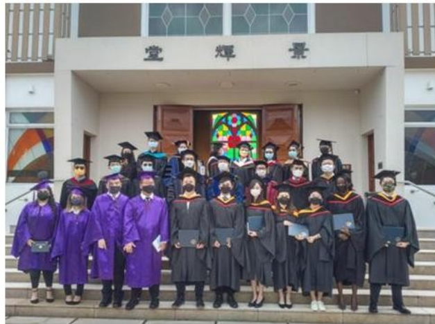
The 2020 and 2021 fine graduates of HKAC and Andrews University (HKAC affiliate), on the front steps of King Huy Hall / Bayview Church, after the commencement ceremony