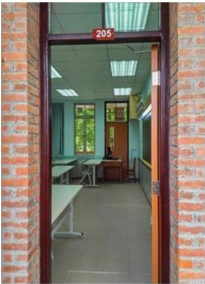
Peering into the newly renovated classroom 205 with its ceiling lights switched on