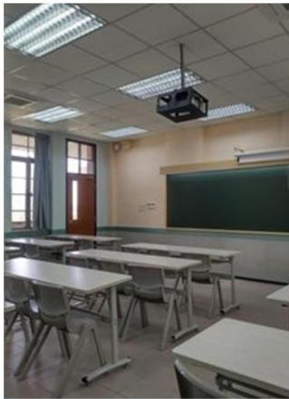
Facing the front and back door of classroom 204 with the overhead projector above