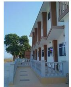
King Huy Hall

In addition, through the generosity of a foundation, HKAC was honoured to receive HK$ 1.1 million (which is equivalent to approximately US $141,578) to do road improvement work in the area leading to King Huy Hall / Bayview Church (right photo). This project is now complete.