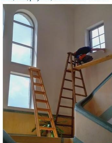
HKAC administration building stairwell interior view of a project worker and the ladders he used to install new windows