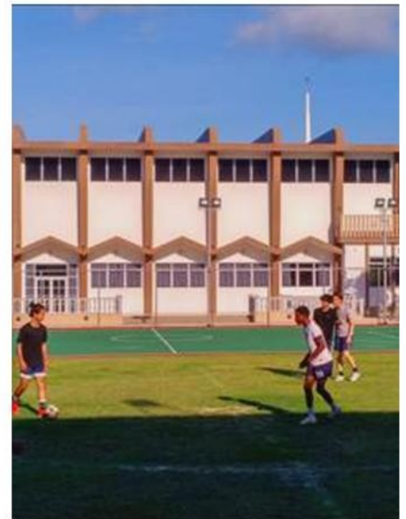
A sunny football game in front of King Huy Hall / Bayview Church