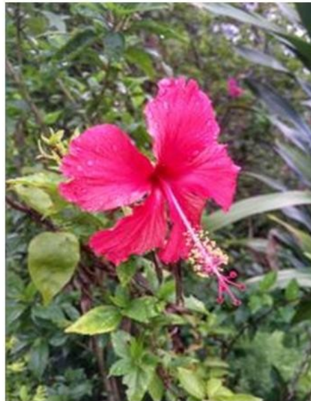
Chinese Hibiscus flower with rain dew drops