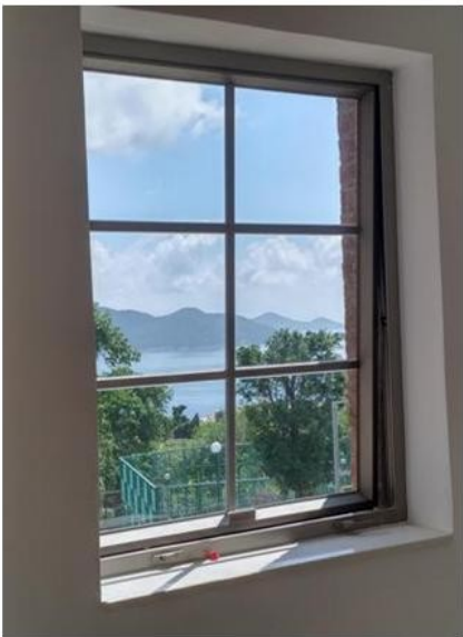
Scenic view of Clear Water Bay from the HKAC administration building's stairwell landing's new latticed window