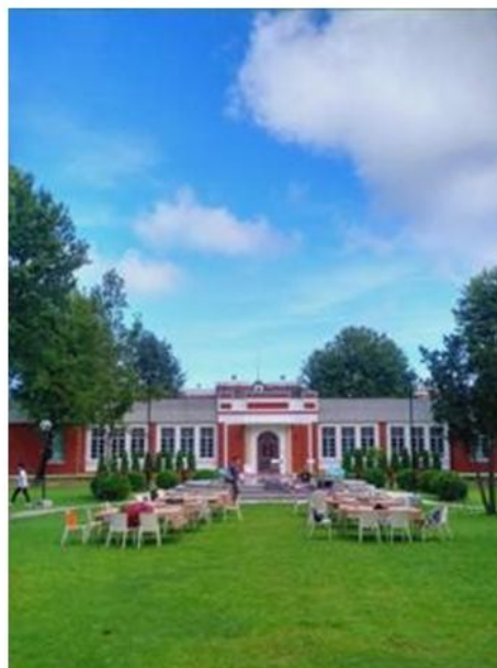
Summer day Page 12 camp dining