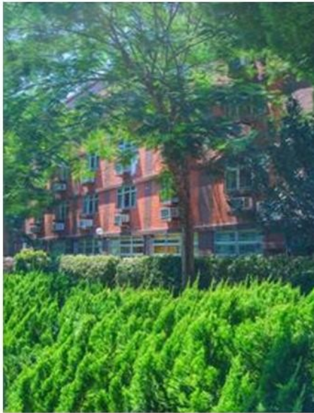
HKAC student dormitories surrounded by the beauty of green trees and shrubs