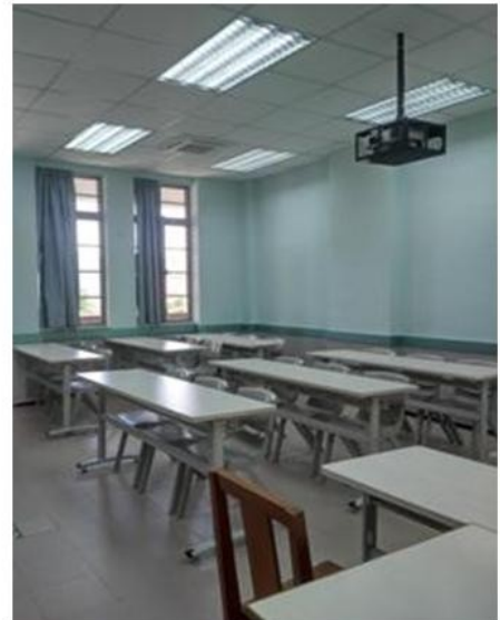
Light blue back wall, wrap around green paint band, seats, projector, classroom 203 windows