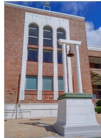
HKAC administration building stairwell new windows facing the painted bell tower