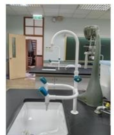
Renovated Biology Laboratory

As of mid-July 2021, we've received philanthropic pledges of US $466,000, which is equivalent to approximately HK$ 3,620,620 (depending on the daily exchange rate for the currency). In the first half of 2021, that fundraising has paid for the following campus projects: