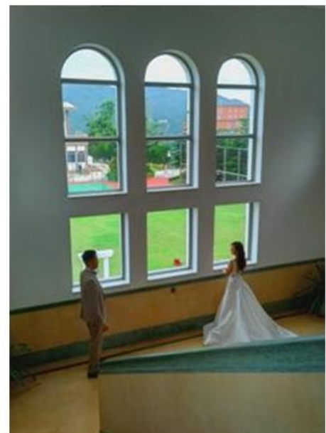
Wedding photo in the HKAC Admin. Building