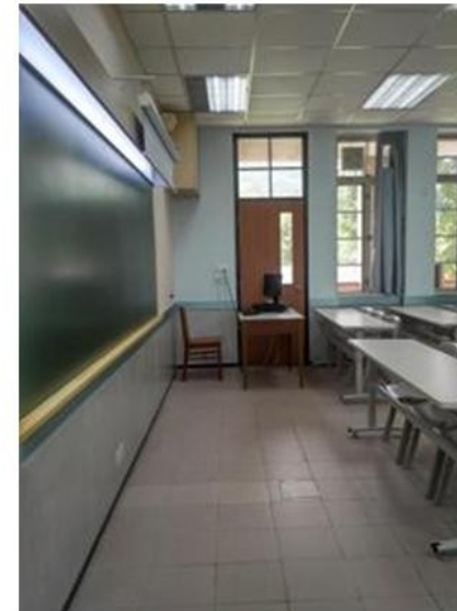
Green chalkboard front view of classroom 202