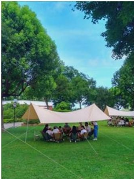
Summer day camp tents pitched one Sunday