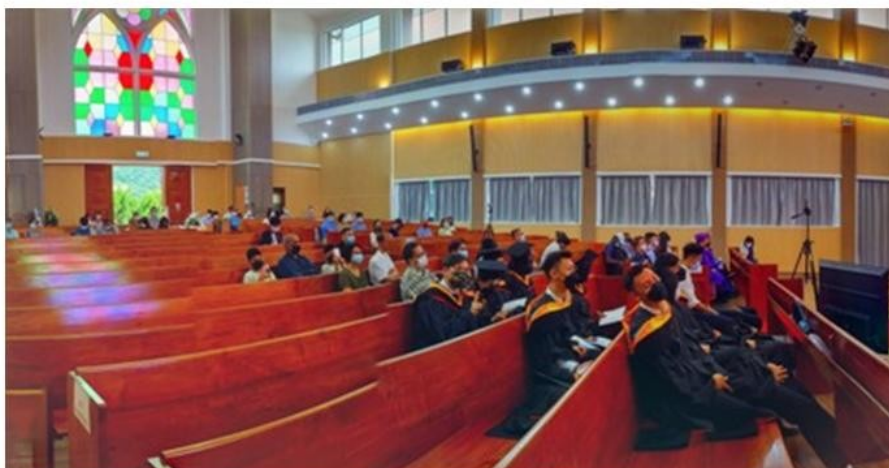
A panoramic view of inside King Huy Hall / Bayview Church during the graduation ceremony