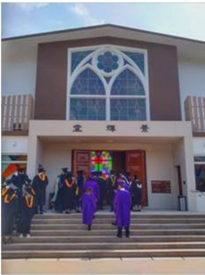
HKAC DPUS and AU Bachelor 2020 & 2021 graduates ascend the stairs of King Huy Hall / Bayview Church