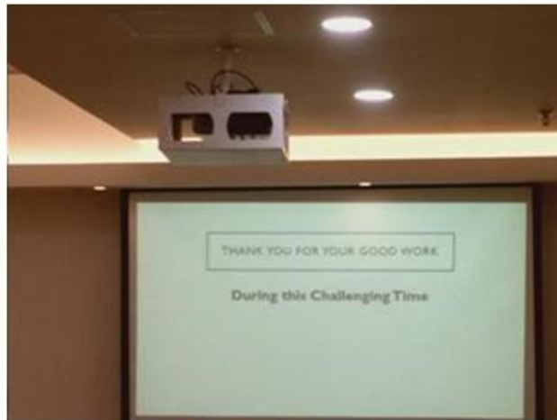
Thank You For Your Good Work During This Challenging Time!