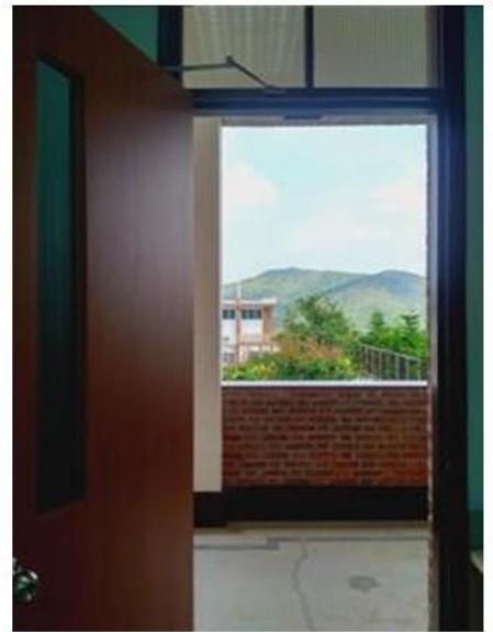
The new classroom 205 door frames the scenic view of part of King Huy Hall and hilly regions