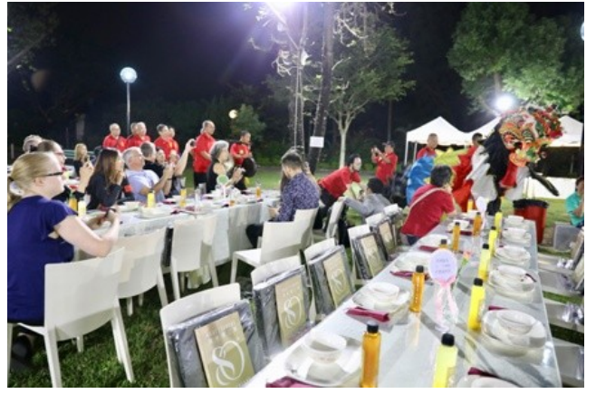
Traditional Chinese Qilin mythical creature does a good luck dance performance at the end of a row of 80th anniversary albums.