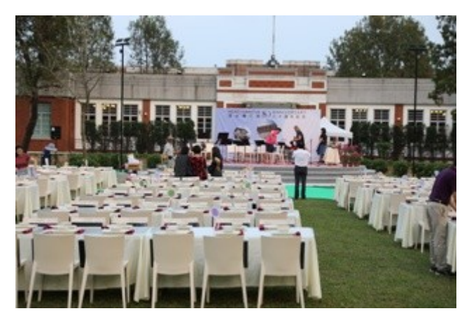
Saturday daytime electrical wiring/sound, and table settings preparations in the front lawn, gala dinner vicinity.