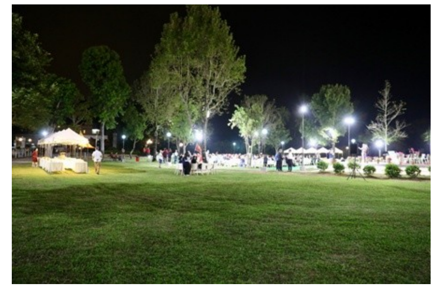
The magical gala dinner outdoor ambiance on the Clear Water Bay campus, featuring two separate food booth pavilions, bright lighting, and Nature's greenery.