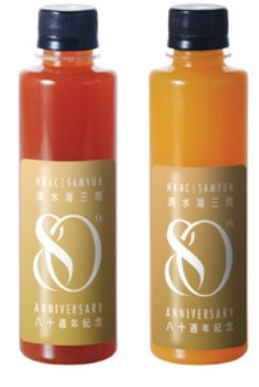
Bless Juice 80th Anniversary Logo