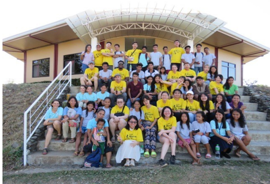
HKAC Mission Team and Mindoro Island KESI Team