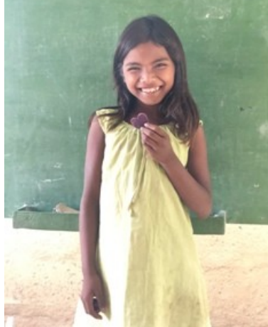
Smiling village girl with a paper heart