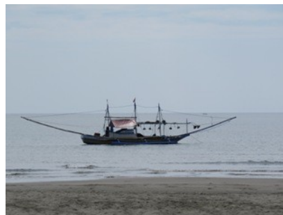
Fishing boat, Mindoro Island offshore