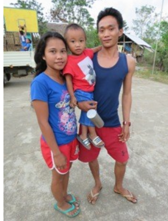
A Mindoro Island family