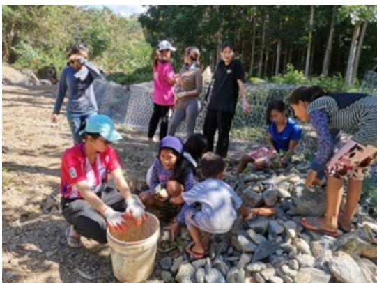
Working on the gabion despite the day's heat