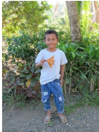
Village boyPage 6 & his origami airplane