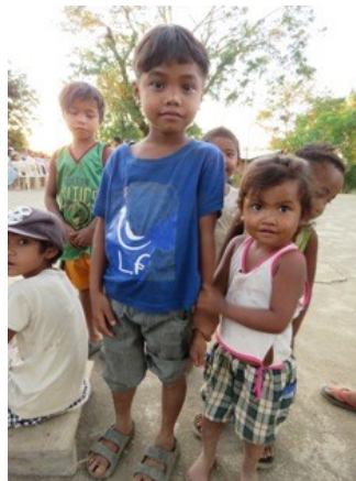
Mindoro Island toddlers