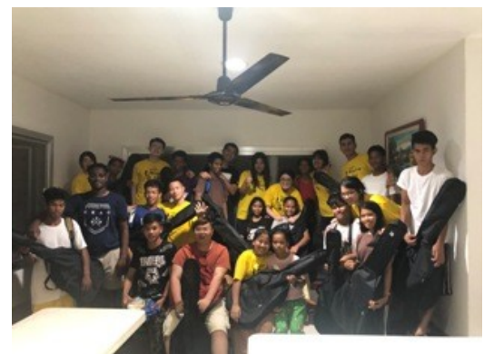
The HKAC Mission Team are ready to rock-n-roll!