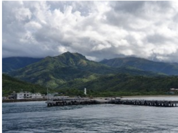
Kaupawan mountaintop and the boat dock at Mindoro Island