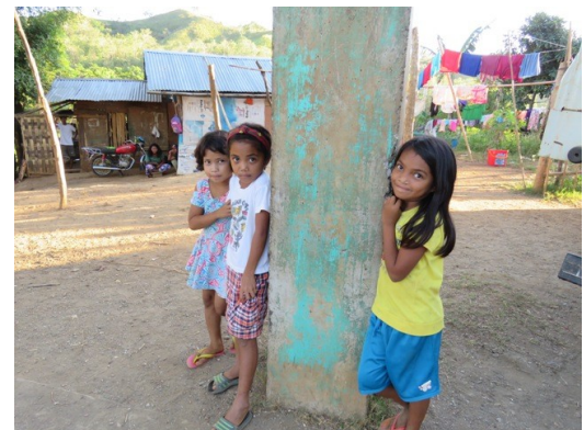
Mindoro Island village girls play near their home