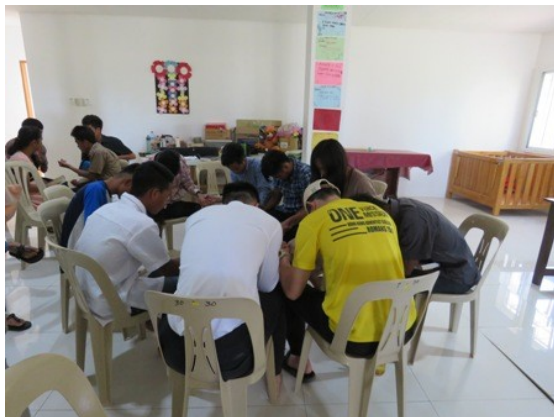
A prayer circle led by a HKAC Mission Team Member