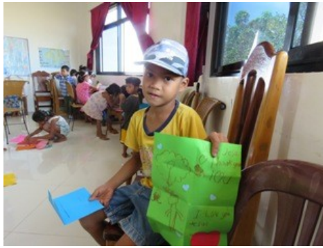
A Mindoro Island pupil shows his creativity