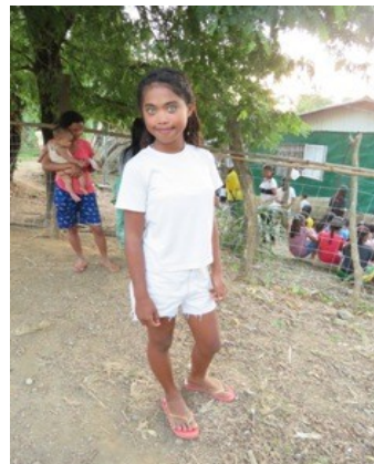
Blue eyed Mindoro Island Girl