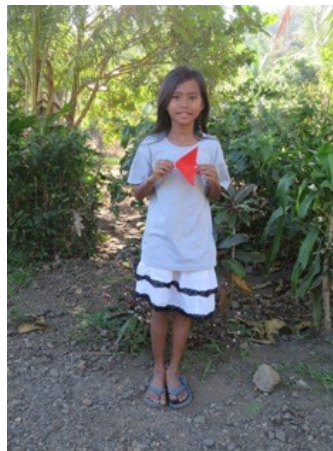
Mindoro Island girl & her origami bird