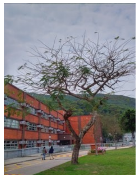
Two students walk to the front part of the campus