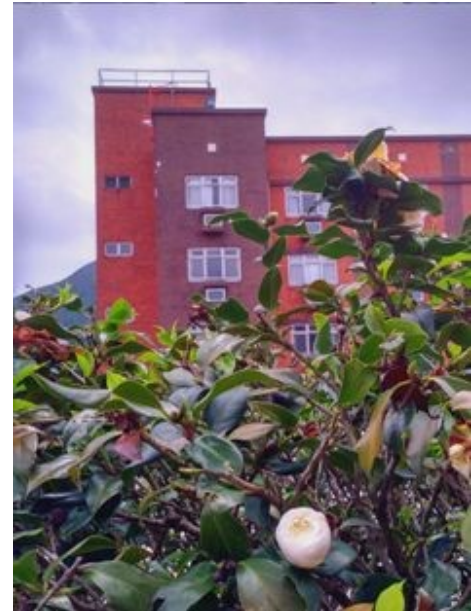
Springtime blooms near one of the HKAC dormitories