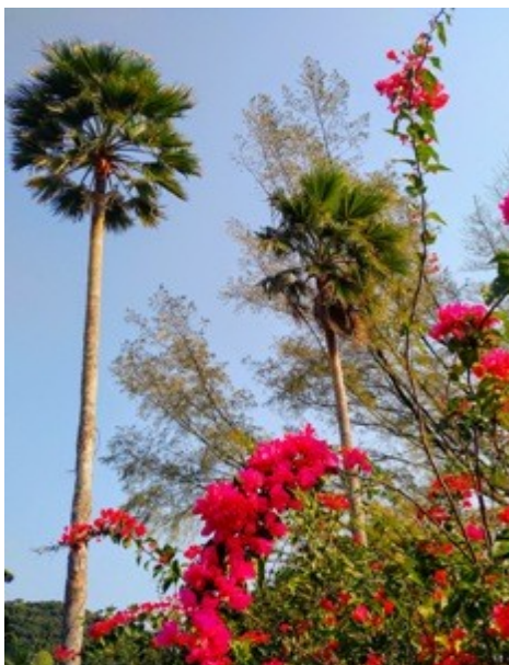
Giant palms and Page 8 cheerful bougainvillea sprays