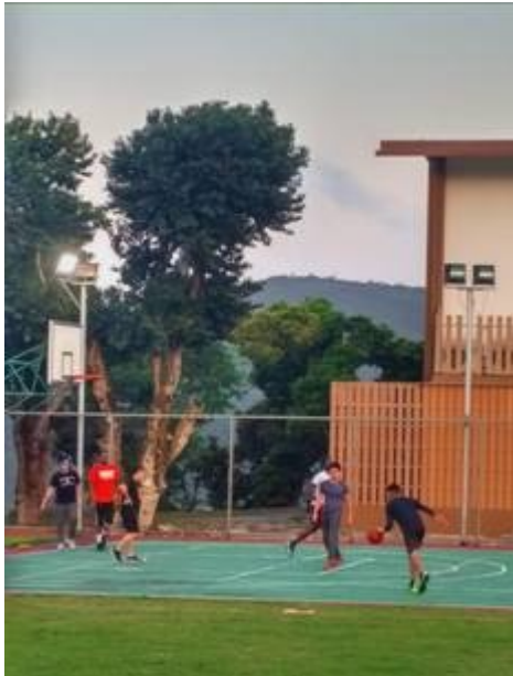
Student Ambassadors and College Students play ball