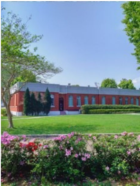
SYMS building, lawn and garden on a sunny day