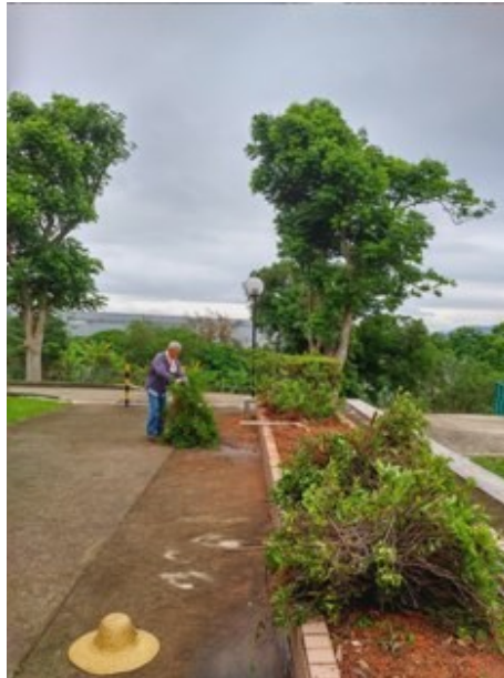
Gardener Li plows out green bushes to aerate soil