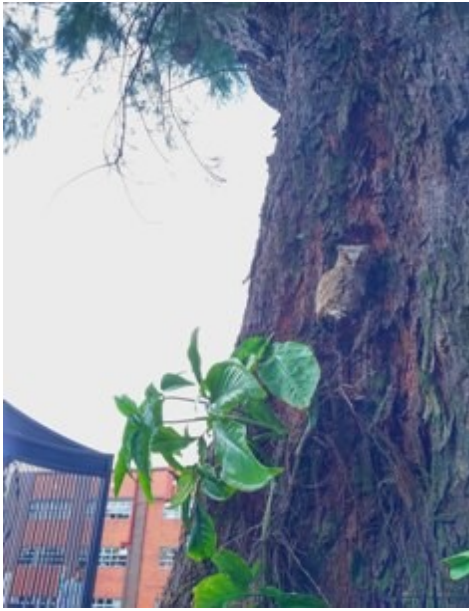
A wise owl graces a tree near the HKAC front gate