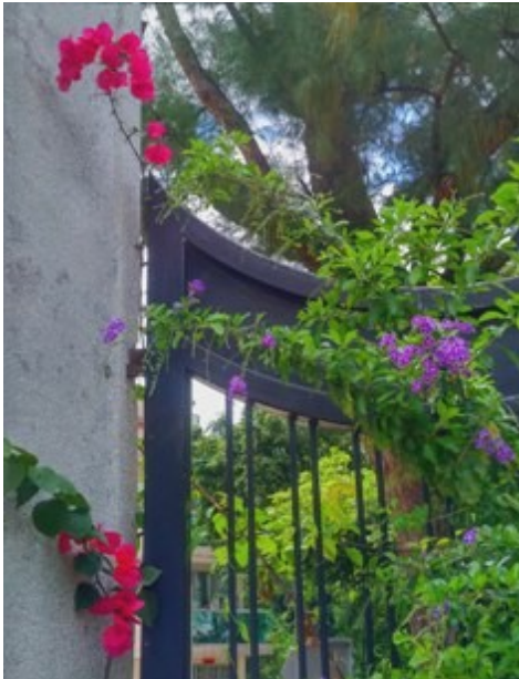
Violet and red flowers adorn the HKAC front gate