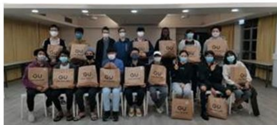
Students with their GU carrier bags of winter goodies