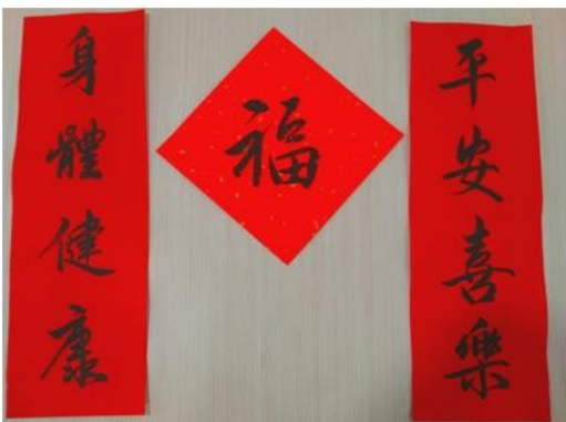
Lunar New Year calligraphy wishing viewers good health, good fortune, peace, and happiness