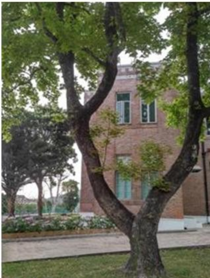
Wishbone tree by the 81 years old HKAC Administration Building