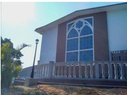
King Huy Hall with new waterproof roof