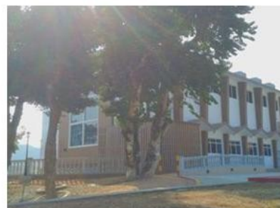
Façade of King Huy Hall with new railing