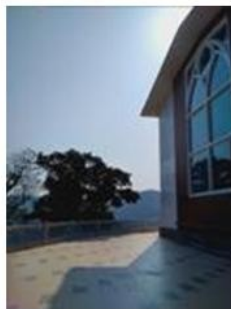
New back walkway and new white railing