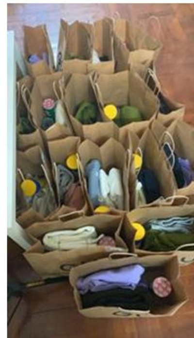
Gu brand carrier bags of winter clothes

As a chaplain working for students and as a co-parent in a family, it weighed heavily on my mind that campus students were living in very chilly conditions. Therefore, while praying earnestly, I contacted some South Korean church pastors and appealed to them about "a winter clothing sponsorship project". When my fellow pastors heard about this project, they fully understood my concerns and were willing to share the love of Christ that transcends borders. Thanks to such love and compassion for fellow human beings, I was able to contribute food that could be warmed up, hand warmers, and winter clothes for HKAC dormitory students.