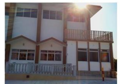
Front of King Huy Hall with new railing