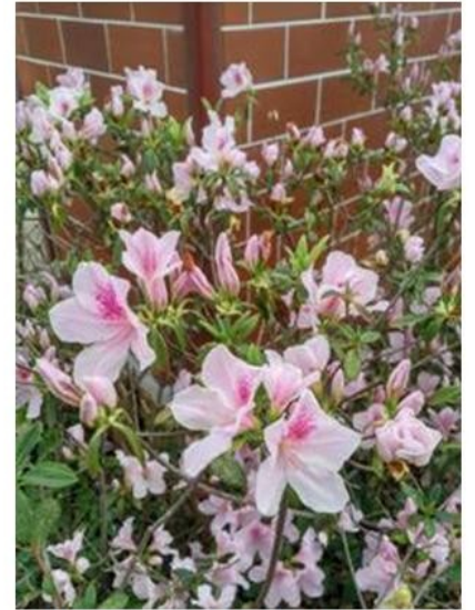
Lily flowers adorn brick fixture