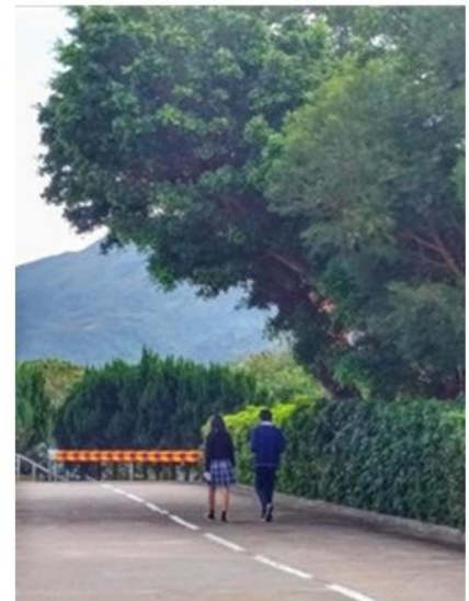
Young love finds its way through conversation and walking around the verdant campus