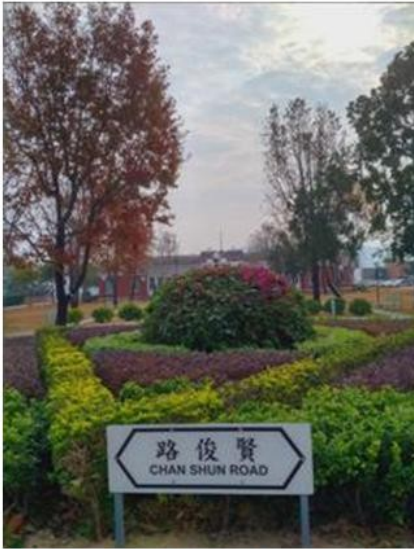
Newly installed Chan Shun Road sign near the front gate entrance