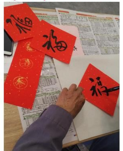
Several "good fortune" calligraphy characters by Gardener Li