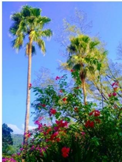
Twin palm trees sway in the sunny blue skies of the HKAC campus