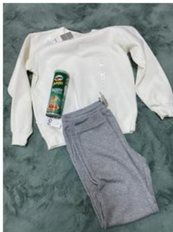
Gu clothing and Pringles chips go together very nicely!

I am sure that these small gifts of sharing will become the seeds of love scattered in the hearts of young students, and that they will grow and bear beautiful fruits. Moreover HKAC students will likely be great servants of the Lord to share generously with those who will be in need in the future. Thus, the love of Christ is like a boomerang and a law of increasing blessings that goes beyond the general concept of mathematics what we learned. Like a drop of water into the sea, love and compassion shared with others ripples outward and increases exponentially.