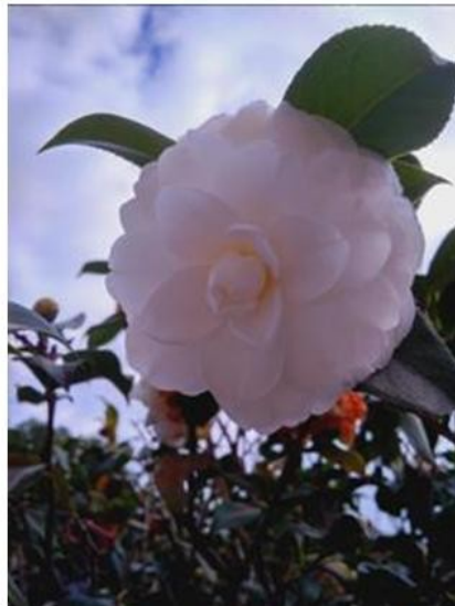
Camellia Japanica (“winter rose”) blooms beautifully on campus