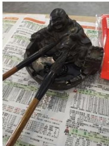
Laughing Buddha ink brush pot and Gardener Li's two brushes