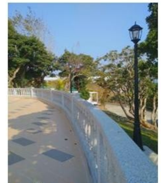
New side walkway and railing