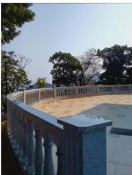
New back walkway and new white railing